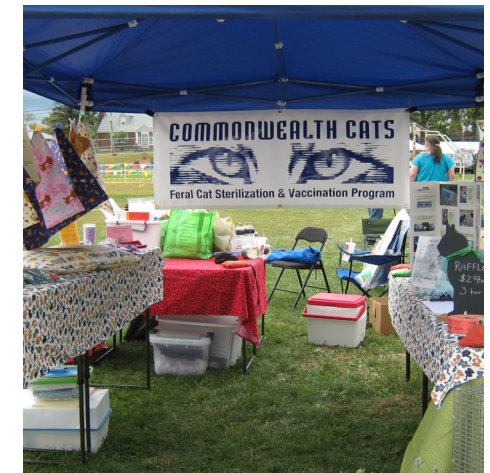
Pet Rock Festival

The first CCI clinic was held in November 2004. As of July 2011, CCI has held 59 clinics and admitted 2,281 cats.